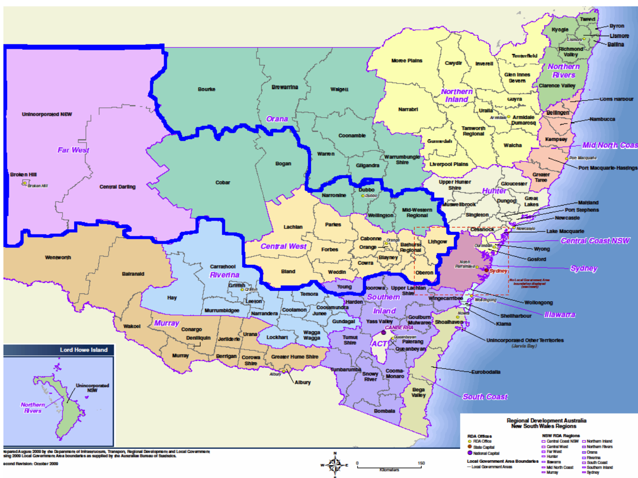
Figure 1 Central western NSW 4

1.24 The Committee has purposefully taken a broad view of what constitutes ‘central western NSW’ in order to undertake a thorough examination of the issues impacting on regional and rural communities across the area of inquiry. We appreciate that in taking this broad view, our area of inquiry encompasses communities that are facing a range of issues, some of which are held in common and others which are unique to specific areas.